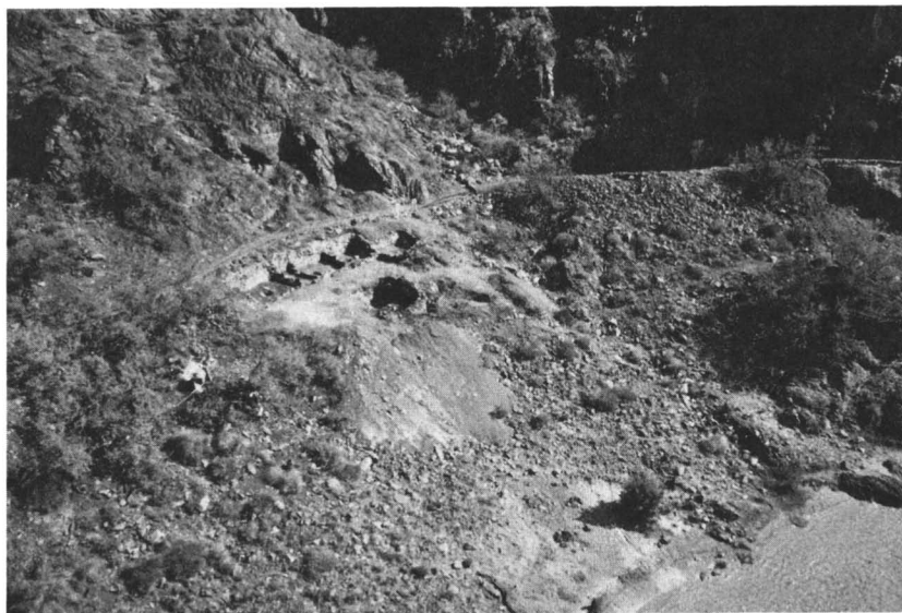
FIGURE 2. General View of Bright Angel Pueblo, Showing Its Location on a Talus Slope above the Colorado River.

The 1969 Bright Angel project was conceived and conducted through the cooperation of the National Park Service and the School of