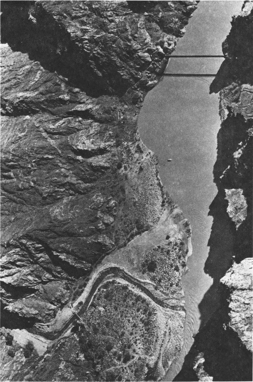
FIGURE 1. Aerial View of Bright Angel Pueblo, Showing Its Immediate Location Near the Kaibab Suspension Bridge.