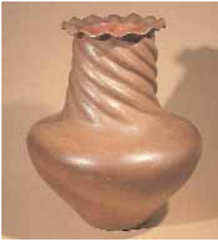
Fig. 3, Upper. Melissa Talachy, indigenous clay and slip, pit-fired.