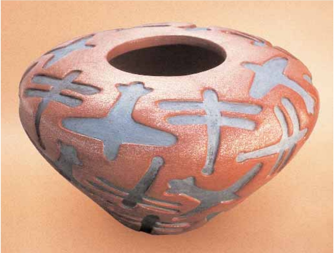
Fig. 2. Melissa Talachy, Dragonflies and Airplanes , indigenous clay, commercial luster, pit-fired.