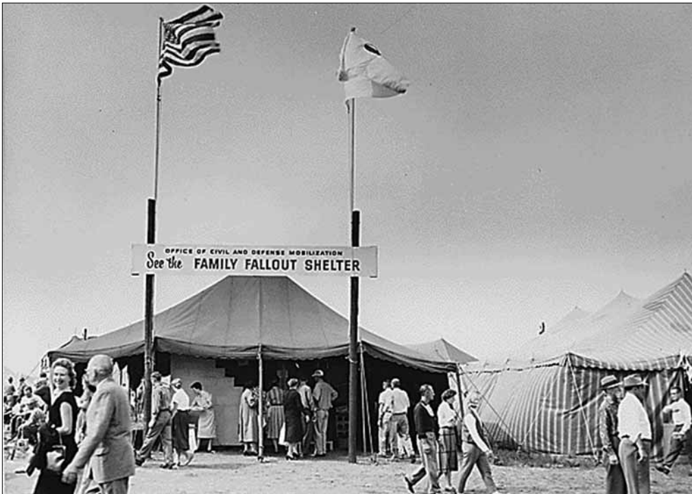
Figure 1.1. Office of Civil Defense Mobilization exhibit at a civil defense fair, circa 1960. The Executive Office of the President established the Office of Civil Defense Mobilization (1958–61), which became the Office of Civil Defense (1961–72) under the Department of the Army. Civil defense programs were largely meant to pacify public concerns over nuclear weapons tests. Officials used fallout shelter displays at county fairs, posters, and other materials to promote products and actions that citizens might take to “protect yourself from radioactive fallout.” ARC identifier: 542102

few of the indigenous, ethnic, and other minority groups who have hosted the nuclear war machine. The disproportionate burden borne by these groups is no accident. Their selective victimization occurs because they live in relatively isolated lands and occupy the bottom strata of society. Their social status is rationalized and reinforced by cultural notions as well as political and economic relationships and histories (Johnston 1994:11–12).