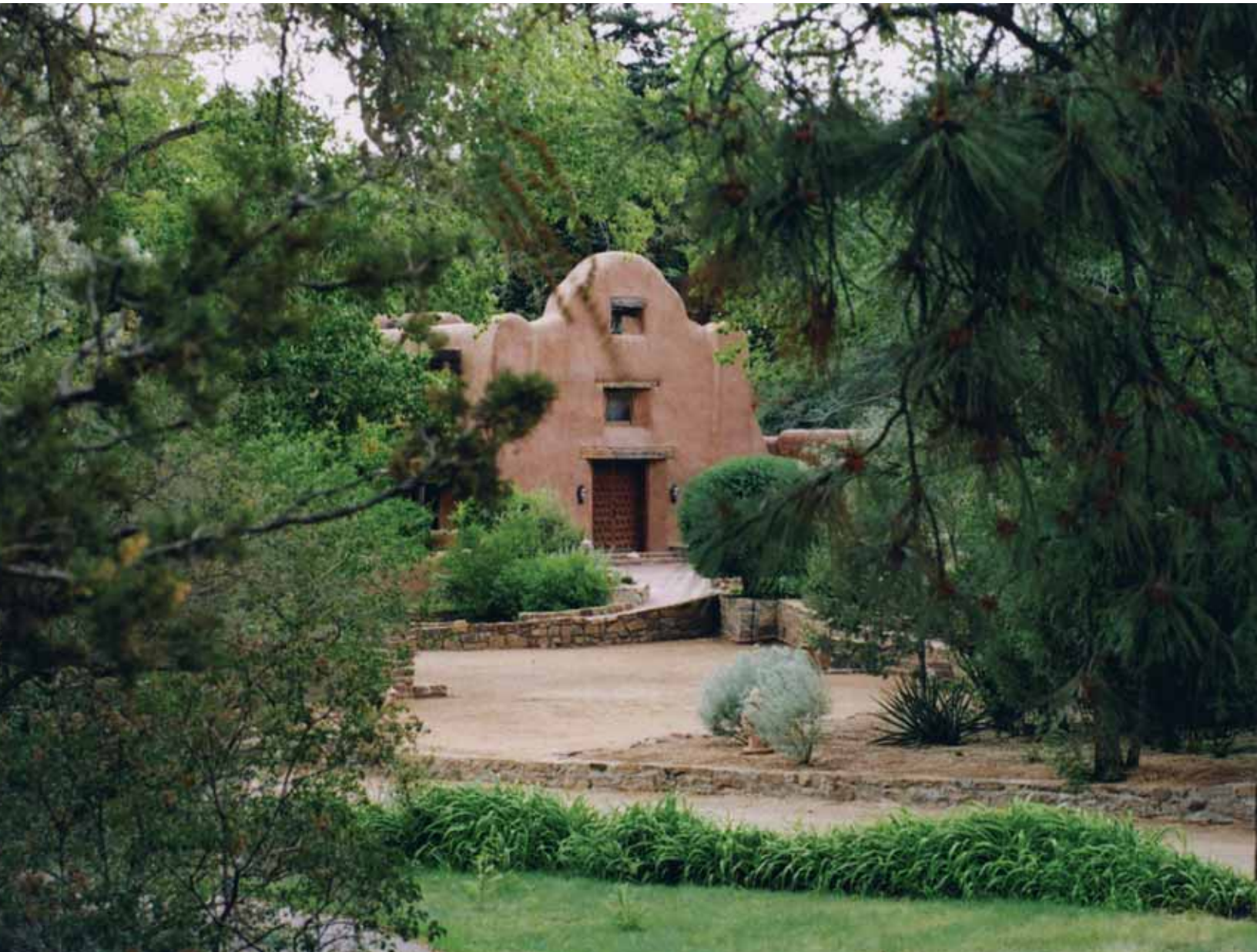
Administration building, School for Advanced Research.