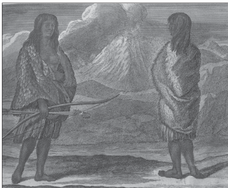
Figure 1.3. Two California Indian women from the San Francisco Bay area, wearing tule reed skirts, a feather cape ( left ), and a deerskin robe ( right ). Hand-colored engraving from an 1816 drawing by Louis Choris, artist for a Russian expedition under Lt. Otto von Kotzebue.

The coastal California seen by European explorers (plate 10) had changed greatly from the place where seafarers first landed thousands of years before. Sea