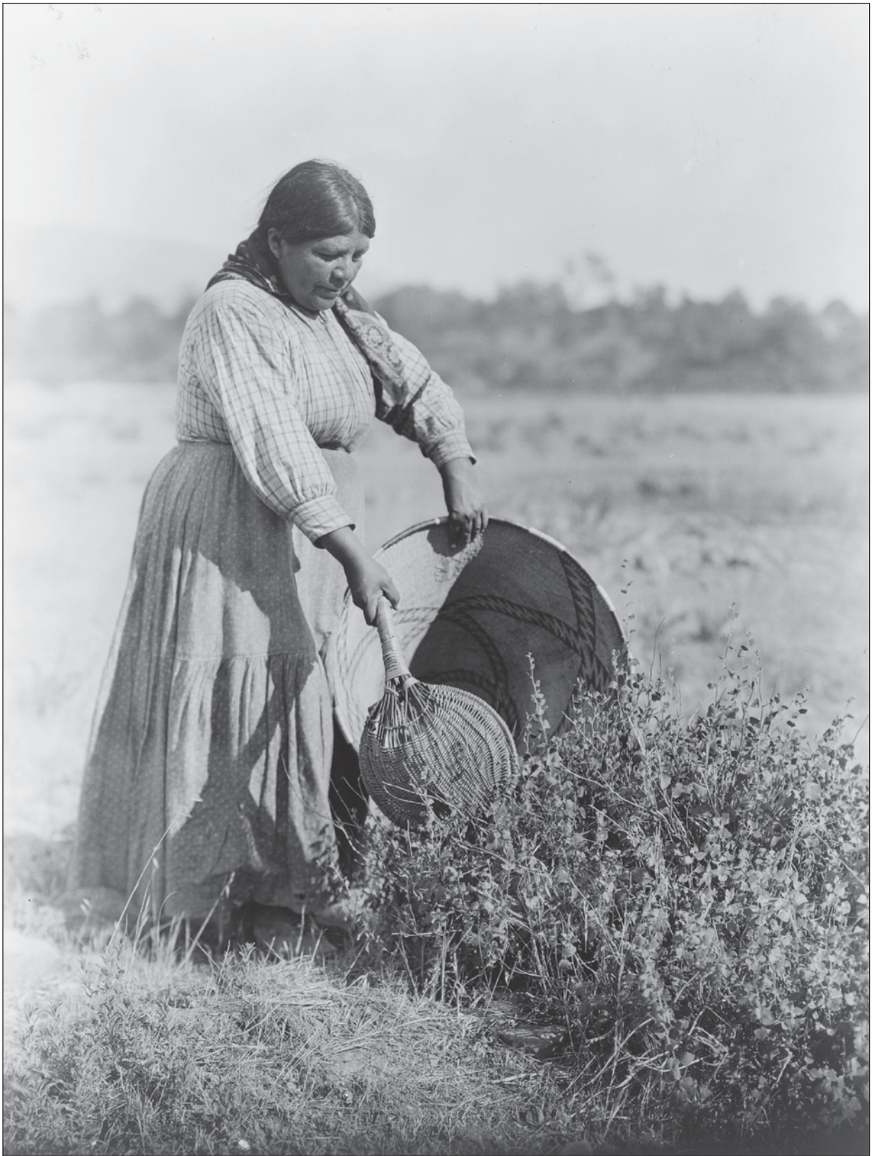
Figure 1.1. A Pomo Indian woman gathering seeds with a seed beater and basket, date unknown. Today, speakers of the Pomo languages live along the California coast north of San Francisco Bay, in some of the same places in which their ancestors lived.